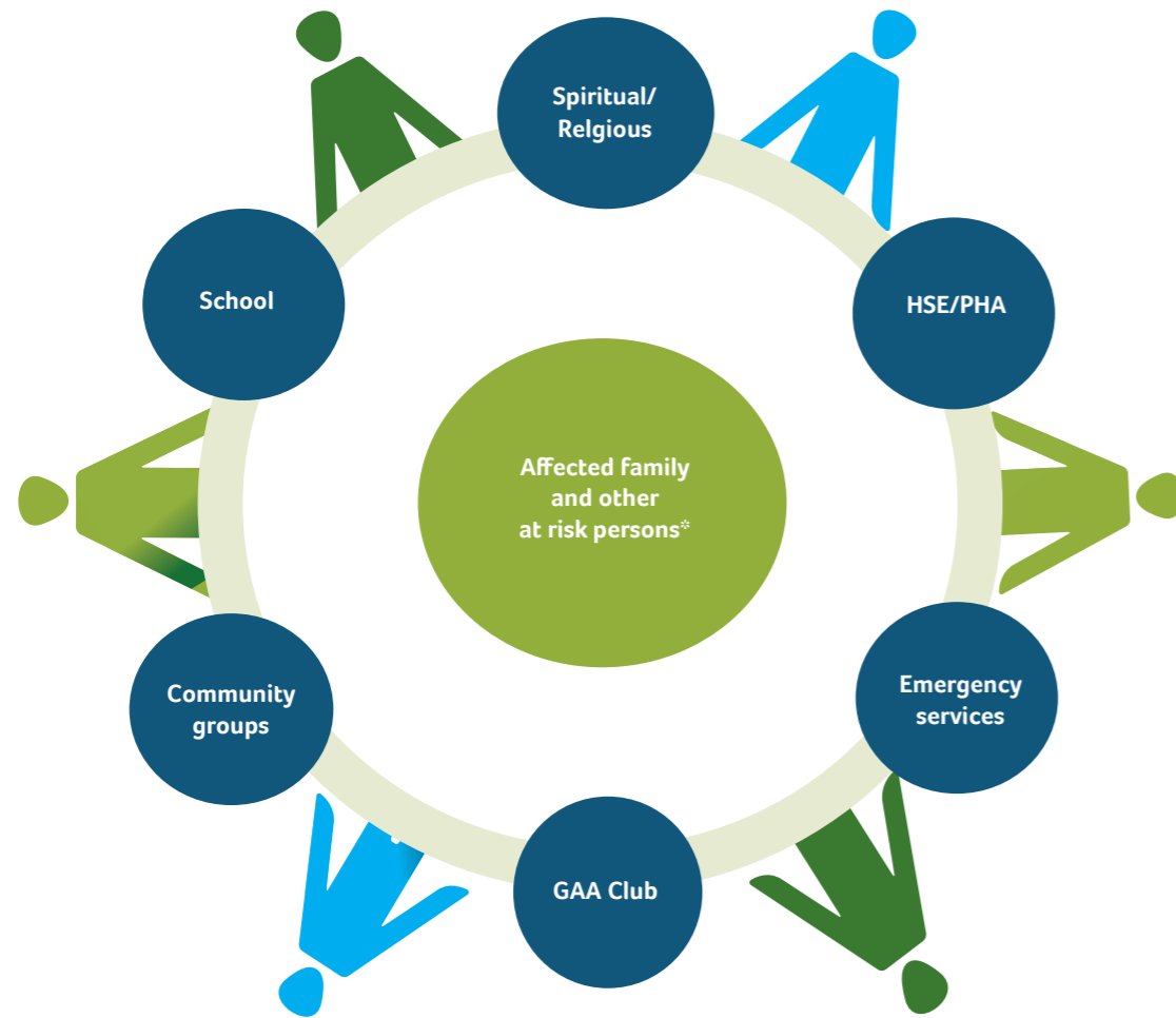
Figure 2: Some potential participants involved a community - based response to a critical incident.

* In addition to the individuals directly affected, other ‘at risk’ persons are amongst those most likely to suffer distress as a consequence of an incident. Evidence would suggest that these may include those who: