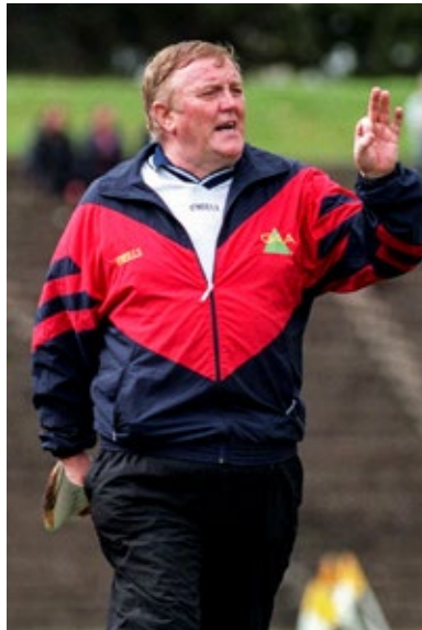
UUJ hurling teams in a stellar career.